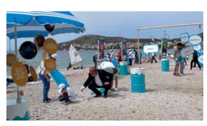
MARLISCO Exhibition at the Beach clean up in Varkiza, 10 May 2014.

Within the MARLISCO project, MIO-ECSDE has prepared an exhibition to sensitise students and the general public on the issue. It is composed of a set of thought provoking panels, which explore the sources, impacts and possible ways to tackling the global challenge of marine litter. The target is for viewers to re-consider their consumption and disposal behaviours and to engage in a re-