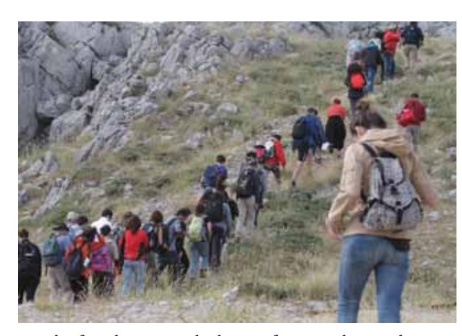
Snapshot from the summer school on ESD for post graduate students (read more p. 19).