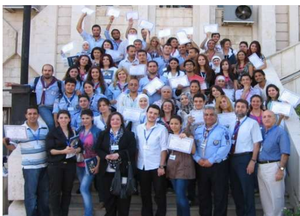
Shot from the certificates distribution.

"Youth X Change in the Mediterranean" led by MIO-ECSDE and co-funded by ALF, aims to adapt the global initiative to the Mediterranean realities. During the event, participants were trained on how to use the newly published guide in the Arabic language which includes case studies from the region appealing to young people and can be used by educators, youth leaders, and civil society activists who wish to inspire a new consumption ethic to their target audiences. All events in Syria were co-organized by MIO-ECSDE and SCSEP Lattakia, while the whole project is co-funded by the ALF Euro Mediterranean Foundation .