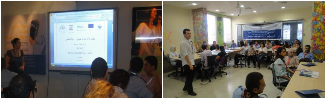
Shots from the activities in the Masar Center

B. From my habits to my values....and back: Based on practical examples of everyday consumption habits, this workshop will try to unveil key personality factors like “value system”, “self efficacy” and “locus of control” that influence the consumption behavior of individuals. Two practical games were applied for this purpose, (i) the Green Bank and (ii) the stand in line game. (Workshop led by Ms. Vania Manjekian )