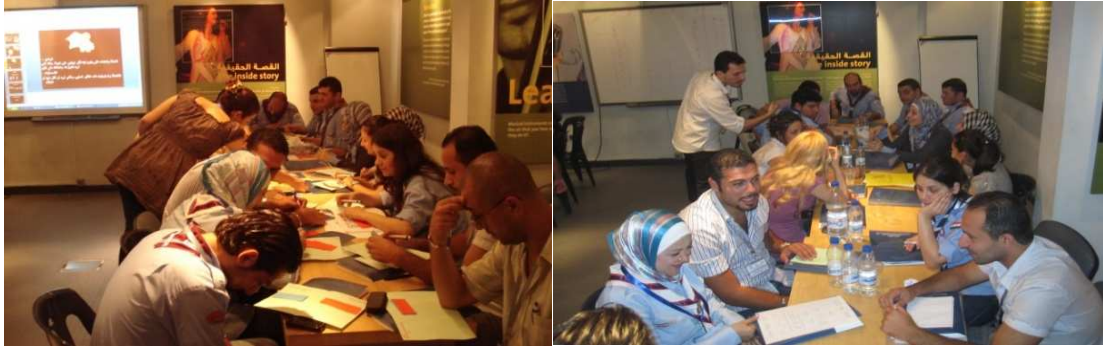
Shots from the experiential workshops in the Masar Center