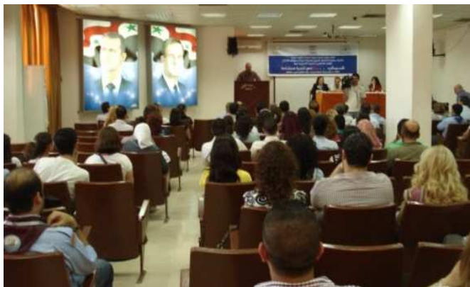
Shots from the launching media event