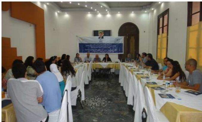
Shot from the evaluation event

Specific recommendations for improvement and following up this activity include i.e. repetition of the workshops in schools and also in other part of the country, with longer in duration and more experiential workshops in the related topics such as the "environment garden", "the green city" and "Mediterranean Clean-up campaigns". Such notes are taken into consideration from SCSEP for the future events, and finally everybody thanked SCSEP, MIO-ECSDE and ALF Euro Mediterranean Foundation.